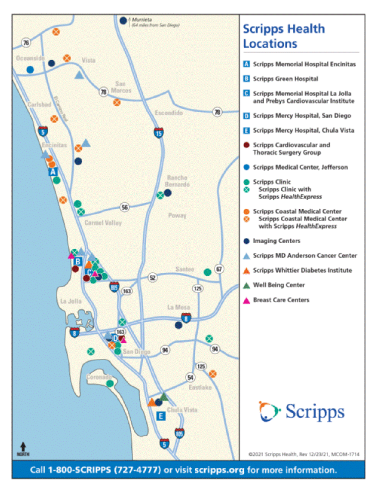
FIGURE 1 – SCRIPPS HEALTH SERVICE AREA