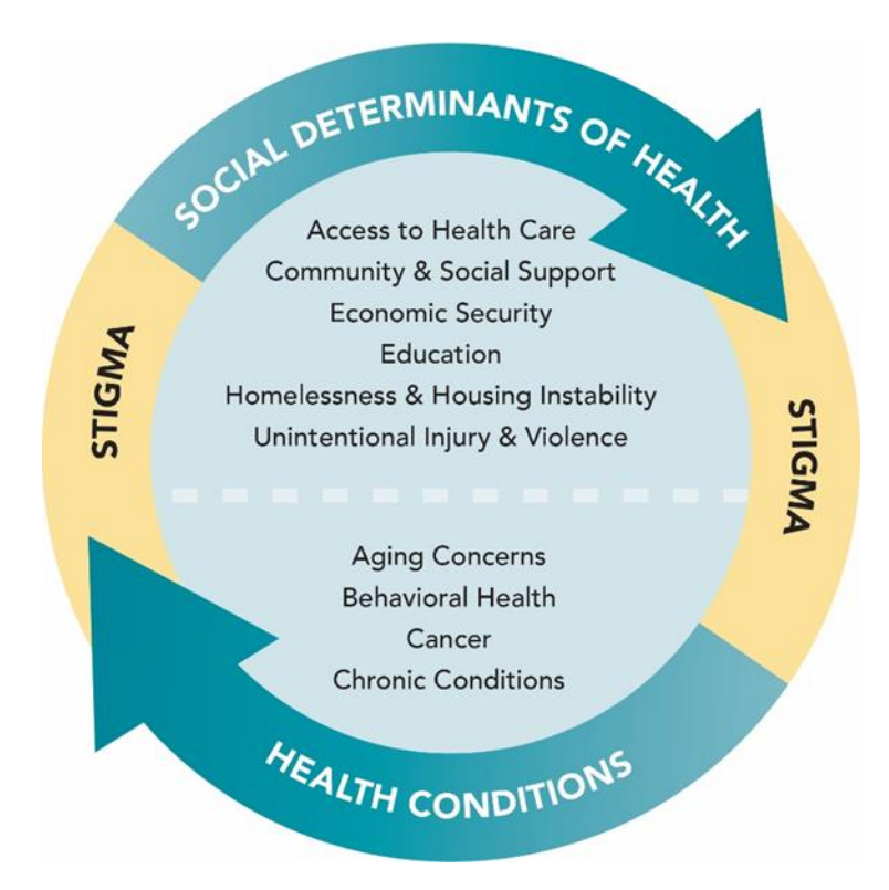
Figure 2 above illustrates the interactive nature of SDOH and health conditions-each impacting the other. In addition, an underlying theme of stigma and the barriers it creates arose across community engagement. In terms of SDOH, stigma impacts the way in which people access needed services, and can impact the community's ability to maintain and manage their health and health conditions. For the purpose of this implementation strategy the following are definitions used to describe the findings.

Access to health care. Access to health care emerged as a high priority health need in both the secondary data analyses and the community engagement events. Overcoming barriers to health care, such as lack of health insurance and insurance issues, economic insecurity, transportation, the shortage of culturally competent care, fears about immigration status, and the shortage of health care providers emerged as a high priority community need. In addition, specific services were identified as challenging to obtain, including behavioral health care, dental care, primary care, and specialty care.